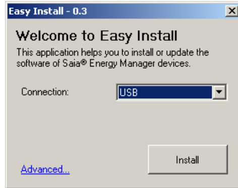
Update over USB

In an advanced window can be selected, which files should be updated. To be able to select files, they must be stored in the program directory, for example: