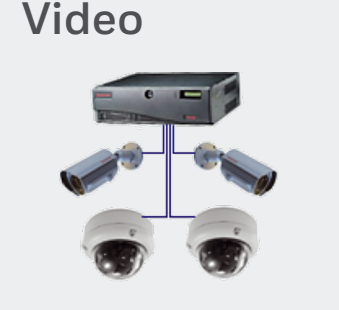
Connected via UPC-UA