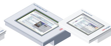
Saia® PCD Web-Panel CE PCD7.D5064TX010